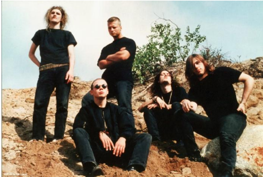
Photo of EDGE OF SANITY 1993